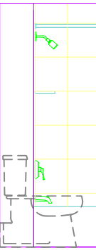
C ELEVATION A-400 SCALE 1/2" = 1'